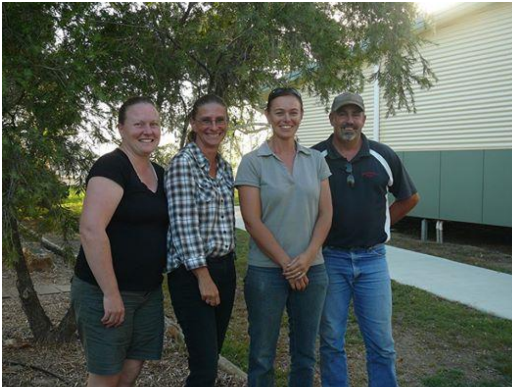
P&C Committee 2014